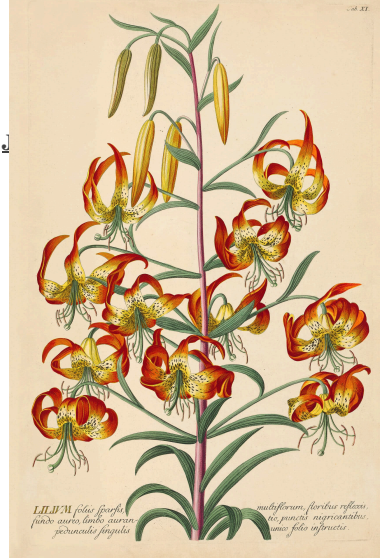
Jakob Trew Plantae Selectae Plate 11 Orange Lily