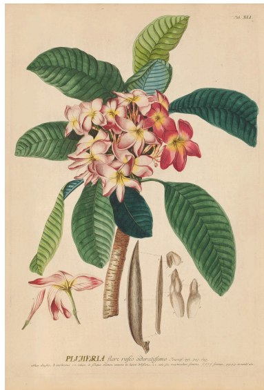
Jakob Trew Plantae Selectae Plate 41 Frangipani