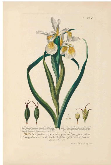
Jakob Trew Plantae Selectae Plate 100 Yellow Banded Iris